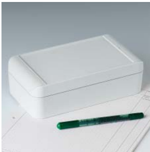
Light grey, RAL 7035

Recessed operating area for the protection of the membrane keyboard. Additional surface for labels on the underside.