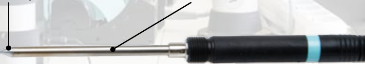
WP 120 pencil

Weller Tools GmbH Carl-Benz-Straße 2 74354 Besigheim Deutschland