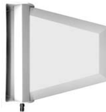
WLD / WLA