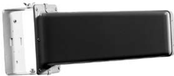
AGY10 / AGY11