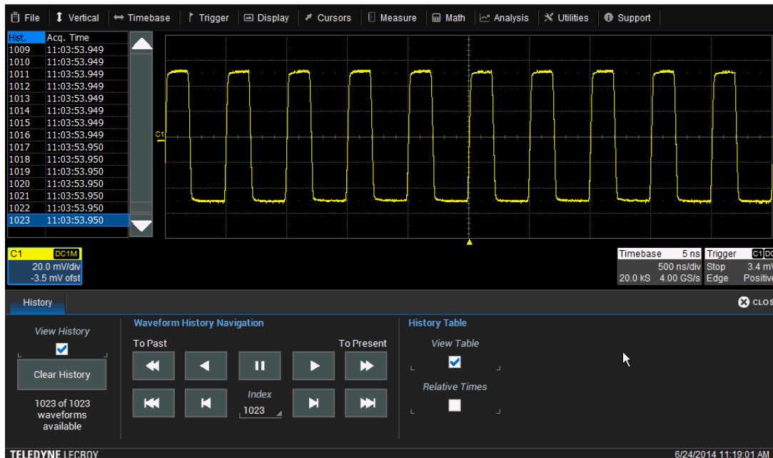
Figure 2: Upon invoking the History Mode option by pressing the front-panel button, users are presented with the controls dialog at the bottom of the screen. Checking both View History and View Table brings up the History Mode table seen at top left. History Mode saves and shows all acquisitions automatically with the time at which they were acquired.

History Mode is best accessed directly from the front panel (it also is available in the Timebase drop-down menu); pressing the History button stops the trigger and quickly displays a list of previously captured waveforms alongside the waveform grid. The History Mode dialog box is shown in Figure 2.