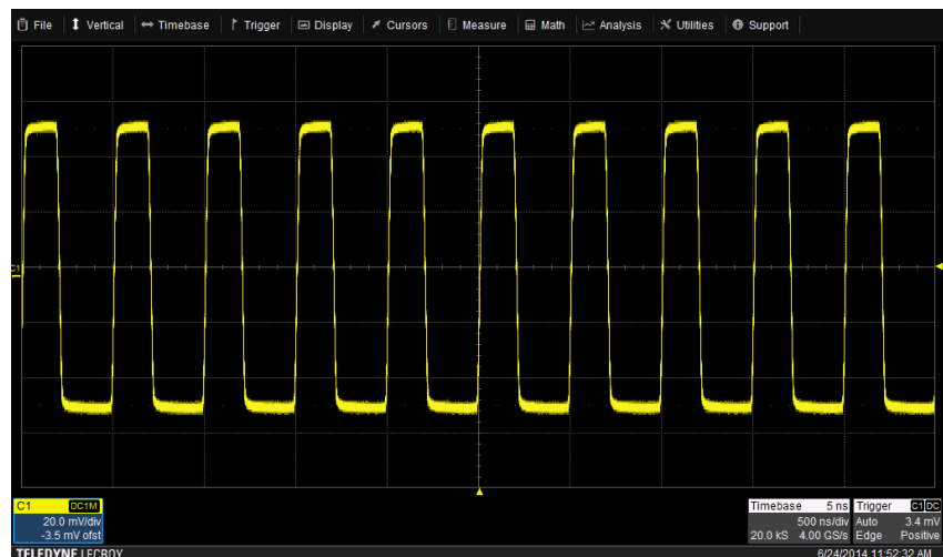
Figure 1: This is the initial setup with a 2-MHz pulse waveform on Channel 1 of the WaveSurfer 3000 oscilloscope.

For this demonstration, we fed a 2-MHz pulse into Channel 1 on the oscilloscope. The initial oscilloscope setup is shown in Figure 1.