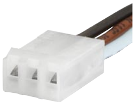
Wire Harness Wire harness for SCHURTER products