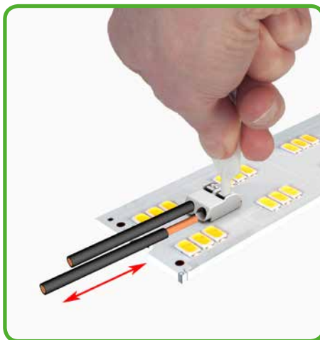
Inserting/removing fine-stranded conductors by lightly pressing on push-button.