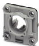
Panel mounting frame, IP67, for Freenet system, for round panel cutout, with grommet, without mounting screws, color: gray

Panel mounting frames - VS-A-F-IP67 - 1653744