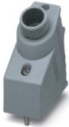
Plastic sleeve housing, locking screws with cylindrical head, type 1, cable screw connection Pg16

Please be informed that the data shown in this PDF Document is generated from our Online Catalog. Please find the complete data in the user's documentation. Our General Terms of Use for Downloads are valid ( http://phoenixcontact.com/download )