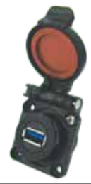
USB3.0-A version (see page 94)