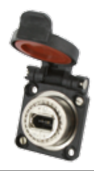
IEEE1394 version (see page 143)