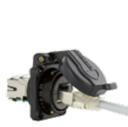
RJ45 version (see page 25)