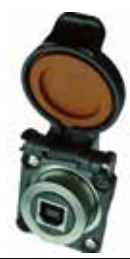
USB-B version (see page 118)