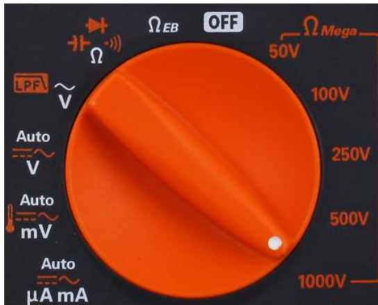
Figure 6. Insulation resistance tester with full featured DMM