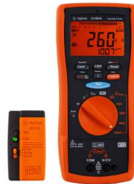
Figure 4. U1117A IR-to-Bluetooth Adapter enables wireless remote testings with the U1450A/U1460A series