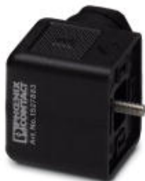
Valve connector, 4-pos., type A, unconnected, screw connection, cable screw connection Pg9

Please be informed that the data shown in this PDF Document is generated from our Online Catalog. Please find the complete data in the user's documentation. Our General Terms of Use for Downloads are valid ( http://phoenixcontact.com/download )