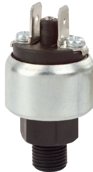
OEM compact pressure switch, miniature format, model PSM04