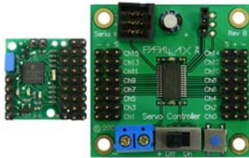
Pololu Micro Serial Servo Controller next to a Parallax Servo Controller.

with our other serial servo controllers and our serial motor controllers, and it offers individual range and speed control for each servo. This servo controller is also compatible with the Scott Edwards MiniSSC II servo controller and any software written for it.