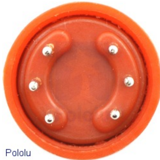
Gas sensor with orange plastic case bottom view.

This Carbon Monoxide (CO) gas sensor detects the concentrations of CO in the air and outputs its reading as an analog voltage. The sensor can measure concentrations of 10 to 10,000 ppm. The sensor can operate at temperatures from -10 to 50°C and consumes less than 150 mA at 5 V. Please read the MQ7 datasheet (185k pdf) for more information about the sensor.