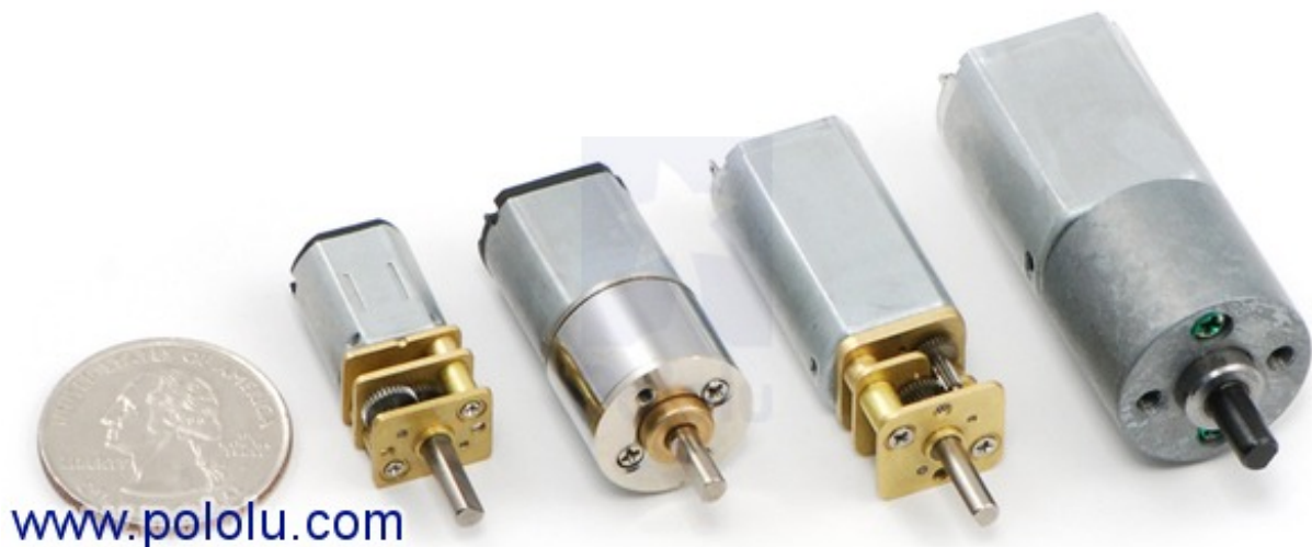
Some of the Pololu metal gearmotors.

We offer a wide selection of metal gearmotors that offer different combinations of speed and torque. Our metal gearmotor comparison table can help you find the motor that best meets your project's requirements.