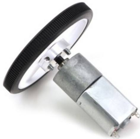
White Pololu 60x8mm wheel on a Pololu 20D mm metal gearmotor.

This gearmotor has an output shaft with a diameter of 4 mm; the Pololu universal aluminum mounting hub for 4mm shafts can be used to mount our larger Pololu wheels (60mm-, 70mm-, 80mm-, and 90mm-diameter) or custom wheels and mechanisms to the gearmotor's output shaft (see the right picture above). The gearbox's output shaft also works directly with the 120mm-diameter Wild Thumper wheels, as shown below.