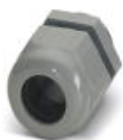
Cable gland, Cable gland material: Polyamide 6, External cable diameter 6 mm ... 12 mm, Shielding: No, Connecting thread: M20, Color: silver-gray RAL 7001

Cable gland - G-INS-M20-S68N-PNES-GY - 1411125