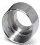
Step-up adapter, M20 to M25, including O-ring

Extension adapter - ENLAR-M-KV-M20/M25 - 1647666