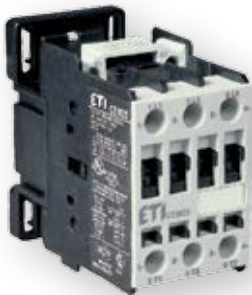
For auxiliary contact blocks, see page 212