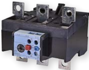
CES-RT4 120, 135, 150