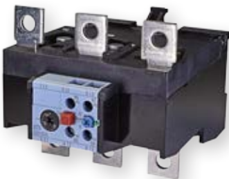
CES-RT4 160, 180