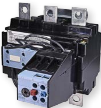
CES-RT4 250, 400