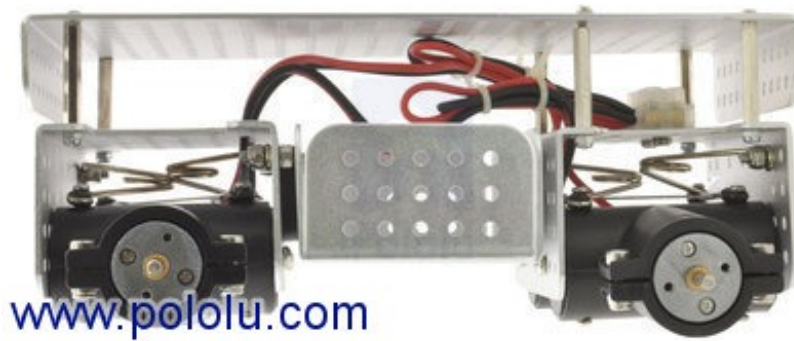
Side view of Dagu Wild Thumper 4WD chassis (silver version).