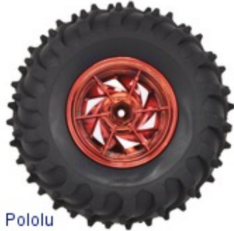
Dagu Wild Thumper wheel 120×60mm (metallic red) interior view.