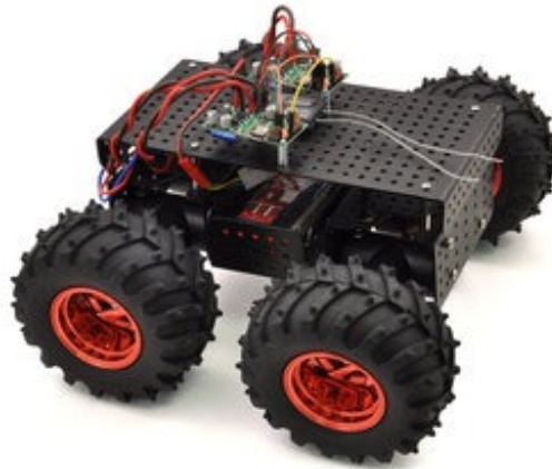
Two Pololu Simple Motor Controllers enable mixed RC-control of Dagu Wild Thumper 4WD all-terrain chassis.

This is a differential-drive chassis, meaning that turning is accomplished by driving the motors on the two sides of the platform at different speeds. The two motors on each side of the robot are wired in parallel, so only two channels of motor control are required to get this chassis moving. The motors are intended for a maximum nominal operating voltage of 7.2 V (2V minimum), and each has a stall current of 6.6 A and a no-load current of 420 mA at 7.2 V. Since the motors will briefly draw the full stall current when abruptly starting from rest (and nearly twice the stall current when abruptly going from full speed in one direction to full speed in the other), we recommend a motor driver capable of supplying the 14A combined per-channel stall current of these motors at 7.2 V. We offer several motor controllers that meet these power requirements and make it easy to get this chassis moving: