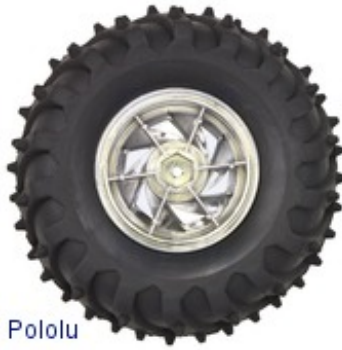
Dagu Wild Thumper wheel 120×60mm (chrome) interior view.