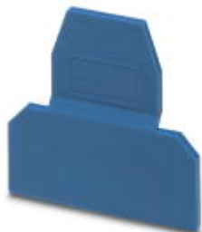
End cover, Length: 56 mm, Width: 2.5 mm, Height: 62 mm, Color: blue

Please be informed that the data shown in this PDF Document is generated from our Online Catalog. Please find the complete data in the user's documentation. Our General Terms of Use for Downloads are valid ( http://phoenixcontact.com/download )