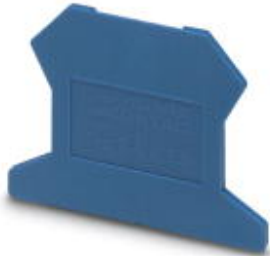
End cover, Length: 42.5 mm, Width: 1.5 mm, Height: 42 mm, Color: blue

Please be informed that the data shown in this PDF Document is generated from our Online Catalog. Please find the complete data in the user's documentation. Our General Terms of Use for Downloads are valid ( http://phoenixcontact.com/download )