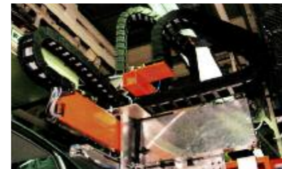
Three energy chain systems® in several axes fitted with specially cables from igus®. e-chain®: System E4/00 and System E4/0