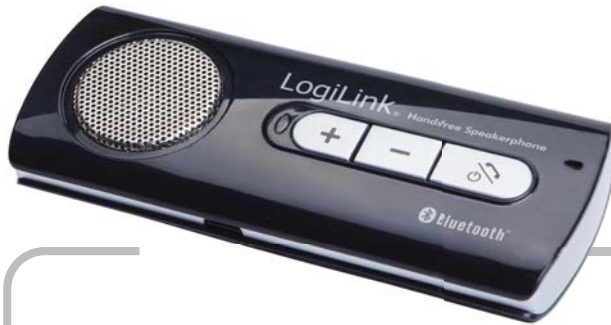
Art No. BT0014