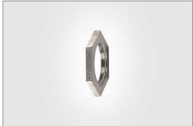
HelaGuard ALS Plated Steel Locknuts.

The ALS hexagonal locknut is used to secure fitting.