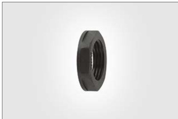
HelaGuard ALPA PA66 Locknuts.

The ALPA hexagonal locknut is used to secure fitting.