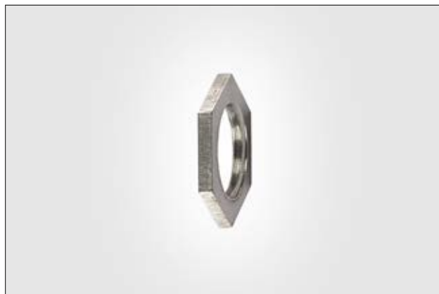
HelaGuard ALNPB Nickel Plated Brass Locknuts.

The ALNPB hexagonal locknut is used to secure fitting.