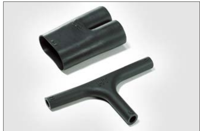
412H622-625 Series supplied / fully recovered.