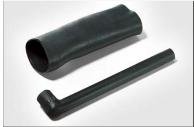
333F322-385 Series supplied / fully recovered.

For Material / Adhesive information please refer to page 260, 261.