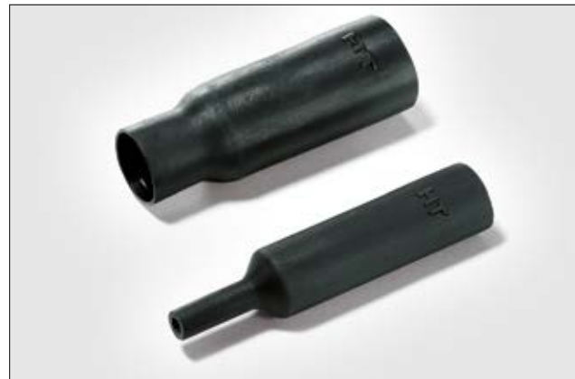
313E445-457 Series supplied / fully recovered.