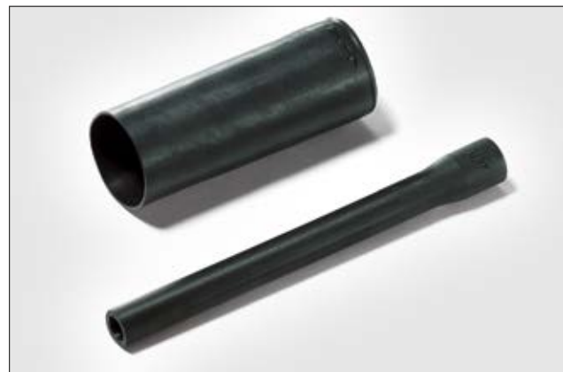
313F322-396 Series supplied / fully recovered.