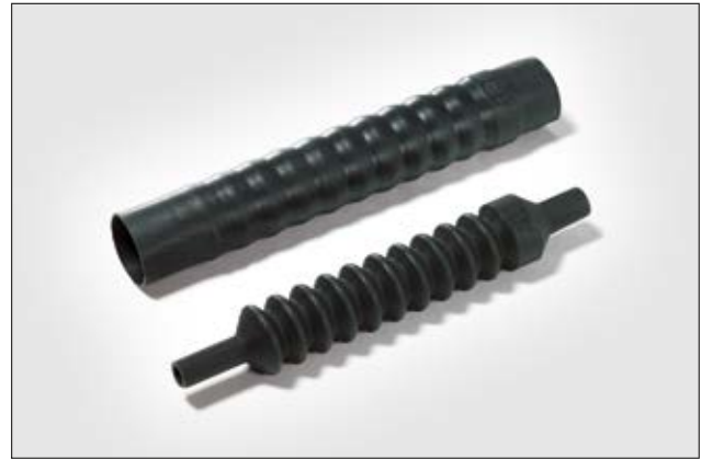
313C722-774 Series supplied / fully recovered.

For Material / Adhesive information please refer to page 260, 261.