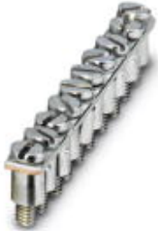
Fixed bridge, pitch: 4.2 mm, number of positions: 10, color: silver

Please be informed that the data shown in this PDF Document is generated from our Online Catalog. Please find the complete data in the user's documentation. Our General Terms of Use for Downloads are valid ( http://phoenixcontact.com/download )