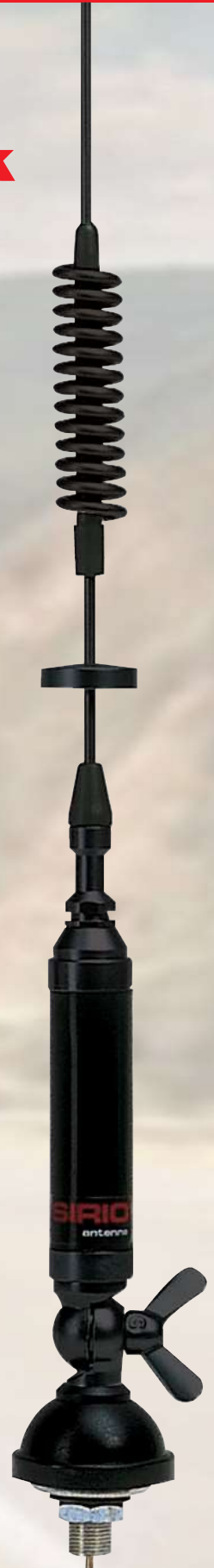
CB 27 U Black

N mount black Mounting hole: Ø 12.5mm Overall size: Ø 41mm 2500102.02