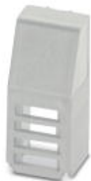
Component housing, color: gray

Please be informed that the data shown in this PDF Document is generated from our Online Catalog. Please find the complete data in the user's documentation. Our General Terms of Use for Downloads are valid ( http://phoenixcontact.com/download )