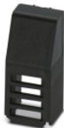
Component housing, color: black

Please be informed that the data shown in this PDF Document is generated from our Online Catalog. Please find the complete data in the user's documentation. Our General Terms of Use for Downloads are valid ( http://phoenixcontact.com/download )