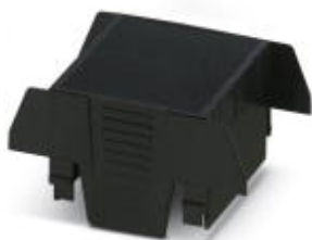
Component housing, connection opening on both sides, Upper part, color: black, width: 52.5 mm

Please be informed that the data shown in this PDF Document is generated from our Online Catalog. Please find the complete data in the user's documentation. Our General Terms of Use for Downloads are valid ( http://phoenixcontact.com/download )