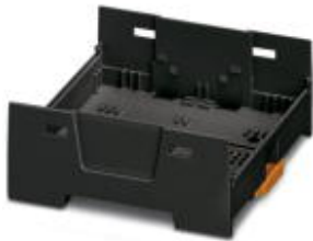
Component housing, color: black, width: 70 mm

Please be informed that the data shown in this PDF Document is generated from our Online Catalog. Please find the complete data in the user's documentation. Our General Terms of Use for Downloads are valid ( http://phoenixcontact.com/download )