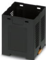
Component housing, color: black, width: 70 mm

Please be informed that the data shown in this PDF Document is generated from our Online Catalog. Please find the complete data in the user's documentation. Our General Terms of Use for Downloads are valid ( http://phoenixcontact.com/download )