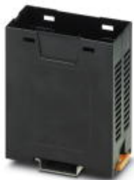
Component housing, color: black, width: 52.5 mm

Please be informed that the data shown in this PDF Document is generated from our Online Catalog. Please find the complete data in the user's documentation. Our General Terms of Use for Downloads are valid ( http://phoenixcontact.com/download )