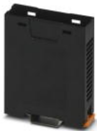
Component housing, color: black, width: 22.5 mm

Please be informed that the data shown in this PDF Document is generated from our Online Catalog. Please find the complete data in the user's documentation. Our General Terms of Use for Downloads are valid ( http://phoenixcontact.com/download )