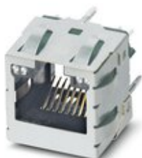
RJ45 PCB connectors, type: RJ45, degree of protection: IP20, number of positions: 8, 10 Gbps, connection method: THR solder connection

Please be informed that the data shown in this PDF Document is generated from our Online Catalog. Please find the complete data in the user's documentation. Our General Terms of Use for Downloads are valid ( http://phoenixcontact.com/download )