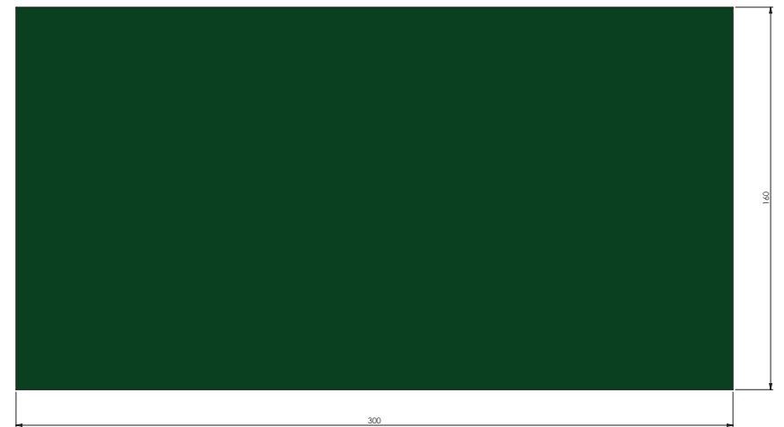
MAX PCB SIZE