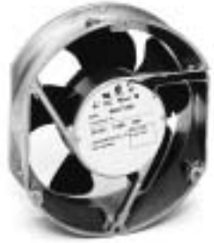
Leads specification : UL 1007 AWG24