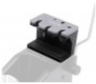
Quick Tip Changer S3-B