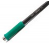
General Purpose Handle T245-A