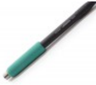
Precision Purpose Handle T210-A