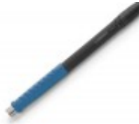
Blue Precision Handle T210-PA