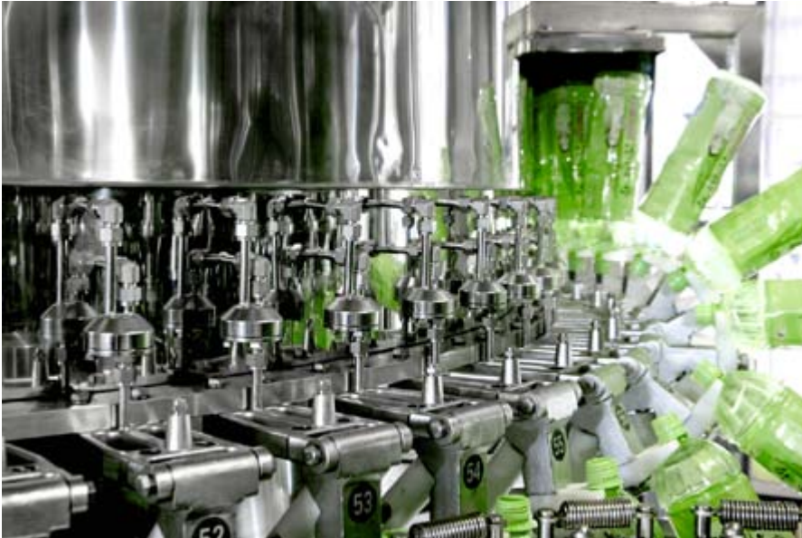
Flow control application in the food industry