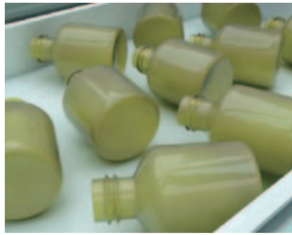
Analog data management for injection molding machines