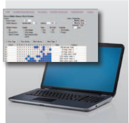
Monitoring via web interface