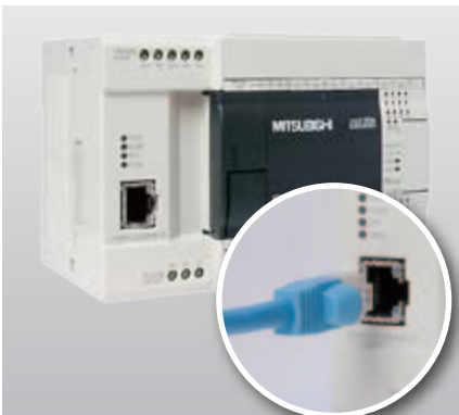
Built-in Ethernet port