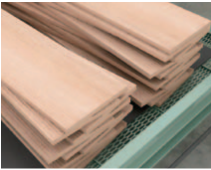
Smooth production control required for wood cutting machines