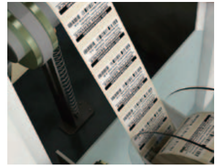
Label printing machines with network functionality