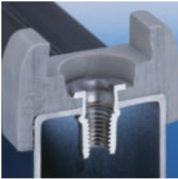
Two functions: riveting and screwing