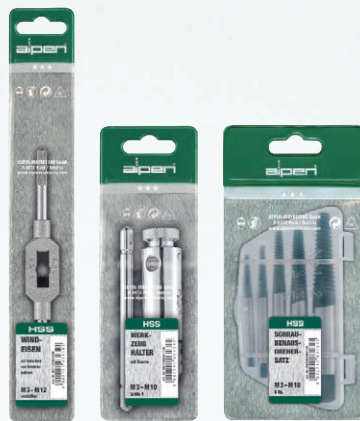
Plastiktasche | Plastic wallet Confezione busta