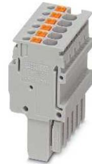
1.5 (1.5) mm 2 , 17.5 A, plug, connection in plug-in direction