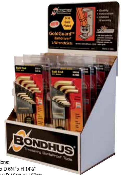
Dimensions: W 8 1/2" x D 6 1/4" x H 14 1/2" W 22cm x D 16cm x H 37cm