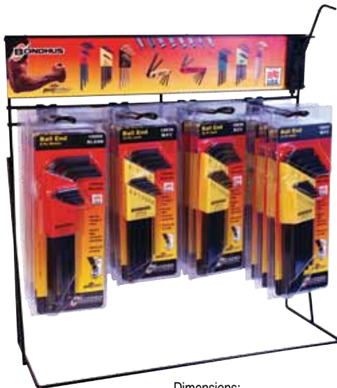
Dimensions: W 15 1/4" x D 9 1/2" x H 15 1/4" W 39cm x D 24cm x H 39cm

Perfect for counter top or rack mounting. This merchandiser is stocked with our most popular L-Wrench sets ensuring quick turns. An interactive Ball End L-wrench demonstration is integrated into the design to illustrate its time saving feature.