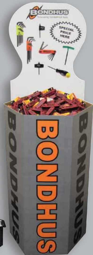
EDP#95022 (Box Only) Dimensions: 22" W x 62" H x 19" D 56cm W x 158cm H x 49cm D