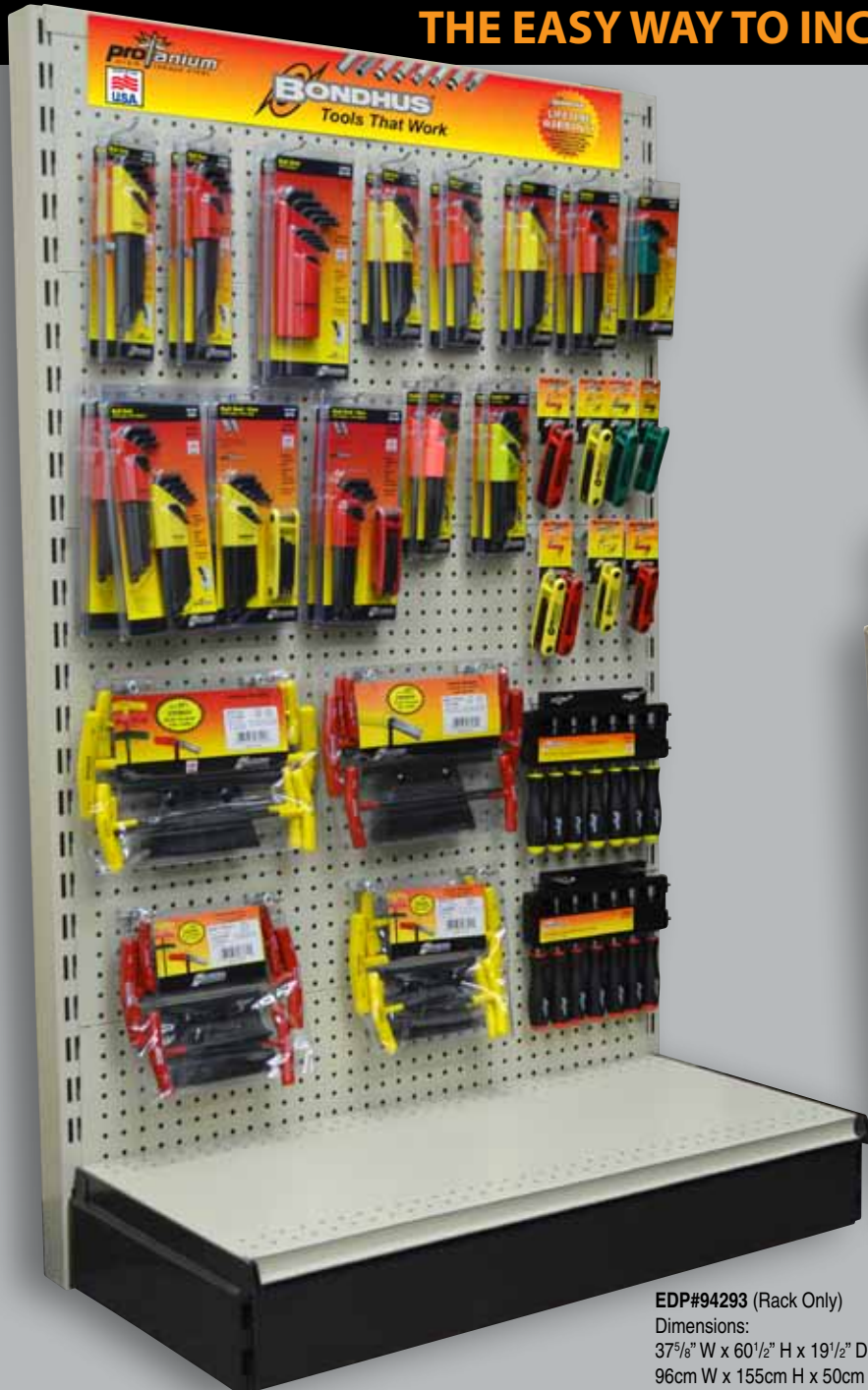
EDP#94293 (Rack Only) Dimensions: 37 5 / 8 " W x 60 1 / 2 " H x 19 1 / 2 " D 96cm W x 155cm H x 50cm D