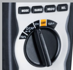
Easy-to-use function knob