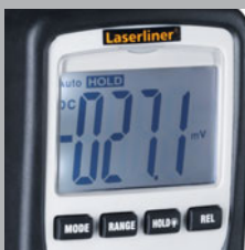
Large, illuminated display