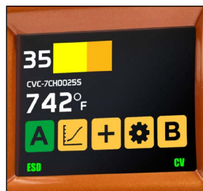
Tip temperature displayed on large color screen.