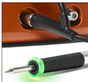
LED equipped hand piece signals to operator when a good solder joint is formed.