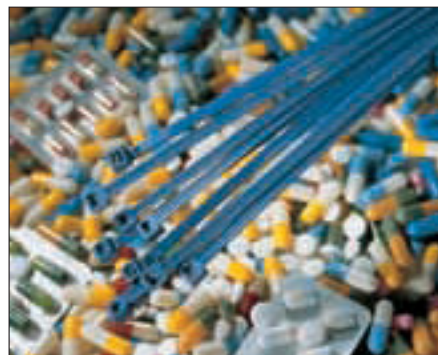
A safe and contamination free production process with MCT.