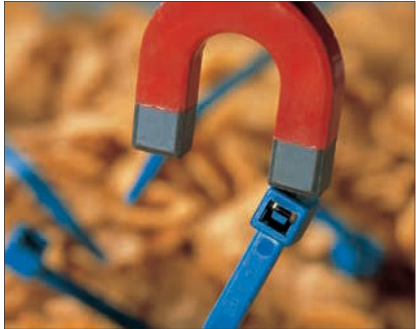
The MCT with metal content.

The Metal Content Tie is a cable tie specifically designed for use in the food & pharmaceutical processing industries. A unique manufacturing process, involving the inclusion of a metallic pigment, enables even small “cut-off” sections of the tie to be detected by standard metal detecting equipment. Ideally suited for the installation of cabling in and around the manufacturing process.